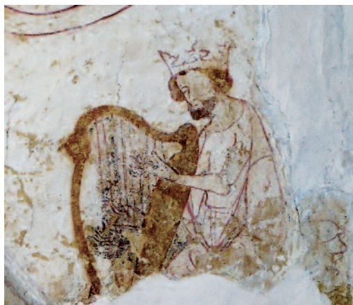
Conservation work in the Great Chamber, Longthorp Tower (left) King David (above)