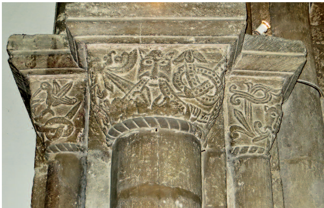
Capital with birds, a cat mask, and a Green Man, St Kyneburgha's Church, Castor