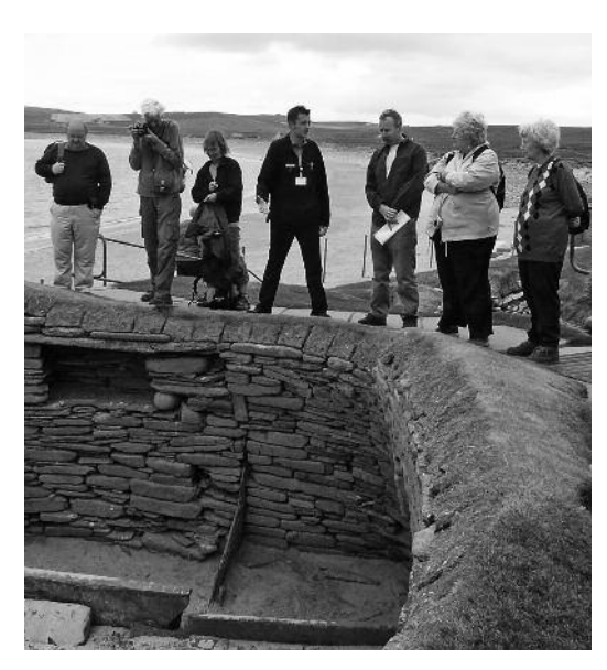
Skara Brae (AB)

provided a fly-infested venue for our picnic lunch.