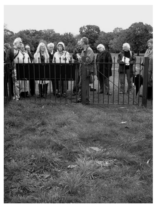
A Romano-Celtic temple? (CvonP)

Romano-British remains have been identified at different times as a villa, a temple or shrine. Excavation has taken place in 1902, 1924/5, 1927, 1978/9 and by Time Team with the Museum of London and Birkbeck College in 1999. Evidence of structures including walls and surfaces, flue tiles and inscriptions have been recorded and coins dating to between 71 and 395 recovered. The site is thought to be a Romano-Celtic temple owing to its location on high ground close to a river, the high status finds and possible plan of the structure. The site is marked by a small area of red tessellated pavement, left exposed after excavations in 1903, surrounded by railings and a small plaque.