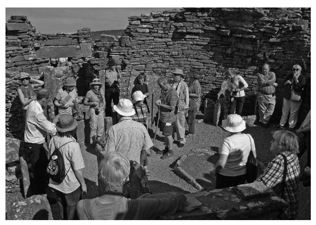
Within the Broch of Gurness (MO'B)

earthworks; remains of a twelfth-century church with claustral buildings were the only standing structures. We crossed the causeway back to the mainland to look at the ruined palace of the sixteenth-century Earl Robert Stuart, illegitimate son of King James V of Scotland. Our attention was distracted by the arrival of a yellow minibus advertising on its sides 'Haggis Adventures: Wild and Sexy'. Its young clientele didn't spend much time at the site. Then on to the Broch of Gurness overlooking Eynhallow Sound. We walked through the maze of chambers built around the central structure of the broch, the most complete known so far but gradually being lost to the sea. The problem of coastal erosion would be a recurrent theme during the week. In view of the unpromising weather forecast, Hedley arranged a paddle stop on a nearby beach.