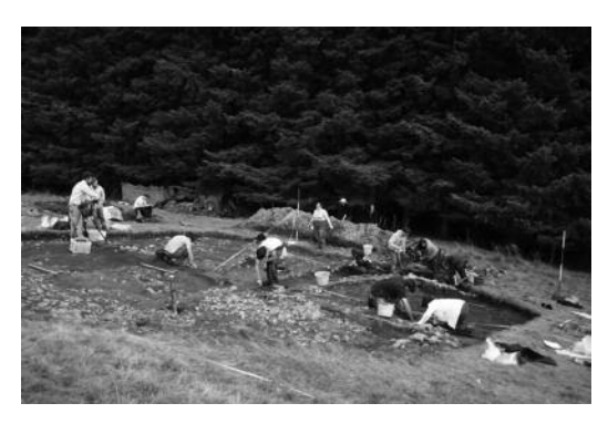
Excavations at Kidlandlee Dean

geochemical and micromorphological sampling to gain an idea of how the plots were used.