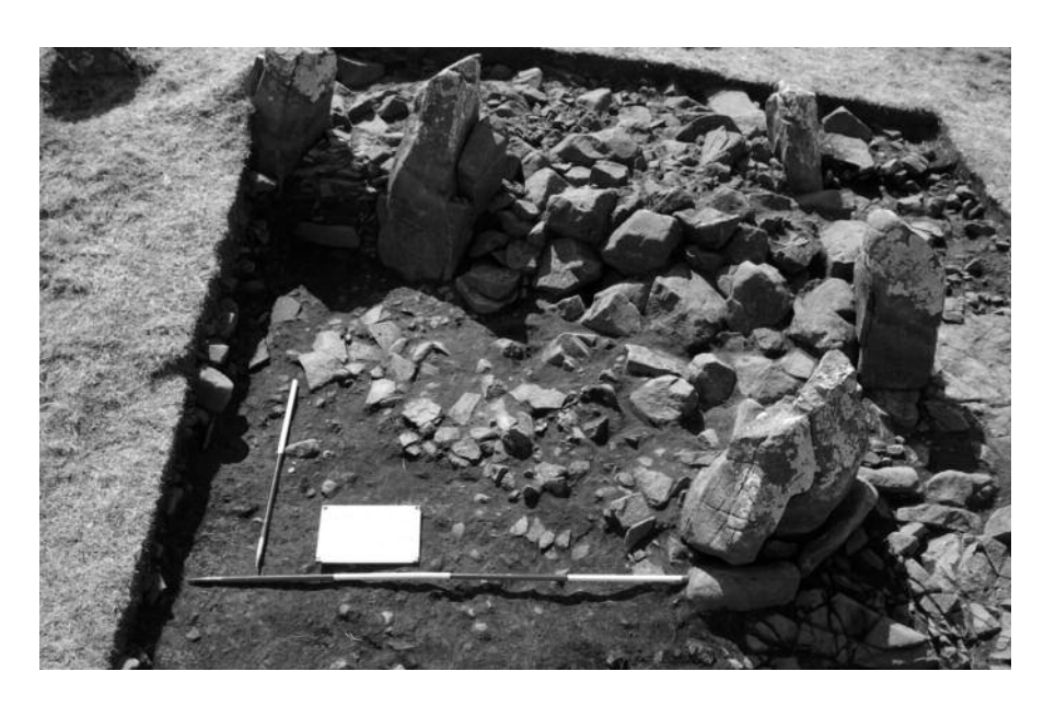
Excavation of the forecourt at Blasthill

Lancashire, at Blasthill, a Clyde-style chambered tomb in southern Kintyre. One trench over the northern part of the forecourt revealed a well-preserved facade with in situ drystone walling in between the facade uprights. The forecourt had originally been paved, and a series of burnt deposits was found underneath the paving which may represent the clearance of the land surface for cairn construction. A Bronze Age bead was found on top of the paving, and the entire forecourt had been infilled with cairn material, effectively blocking access into the monument.