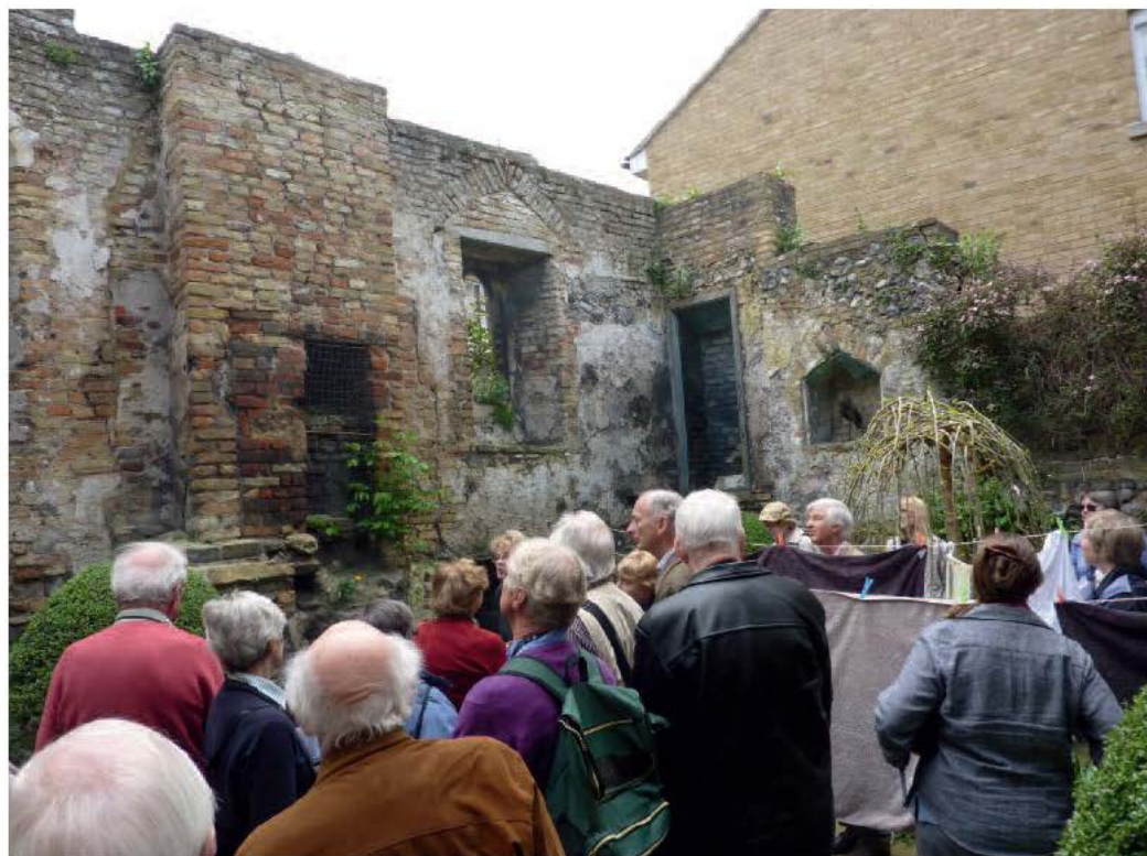
Three Kings Yard, The Chanter's House

expeditions of 55 and 54 BC are believed to have landed further round the coast in the Deal area, the successful Claudian landings led to the establishment of Richborough as an important Roman port and supply base. There is a passage in Cassius Dio (LX, 19,1) relating to the landing at Richborough. The invasion force, he says, sailed in three divisions. It was first of all driven back on its course, presumably by the weather, and 'on the strength of the reports they received the Britons had concluded that they were not coming and had not assembled to meet them'. This is more or less what happened, though with the Germans as defenders, 1901 years later. We walked around the imposing remains of the later third-century Saxon shore fort, and among the ramparts of the late timber fort within, where the baptismal font from an early Christian church is of especial note.