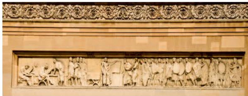
Frieze at Buckingham Palace. King Alfred enacting the Laws