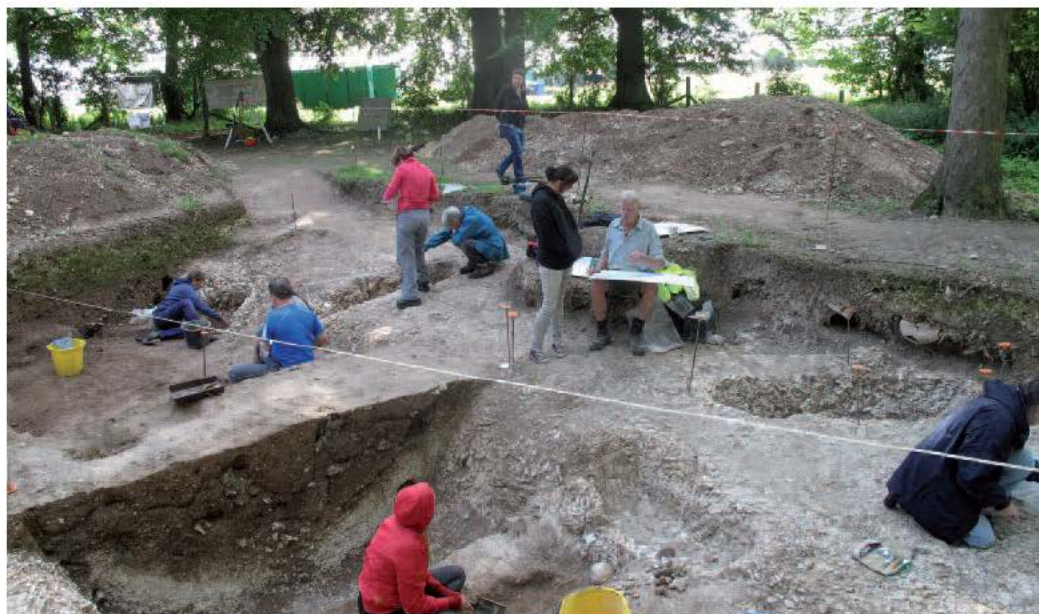
Excavations at Barrow Clump