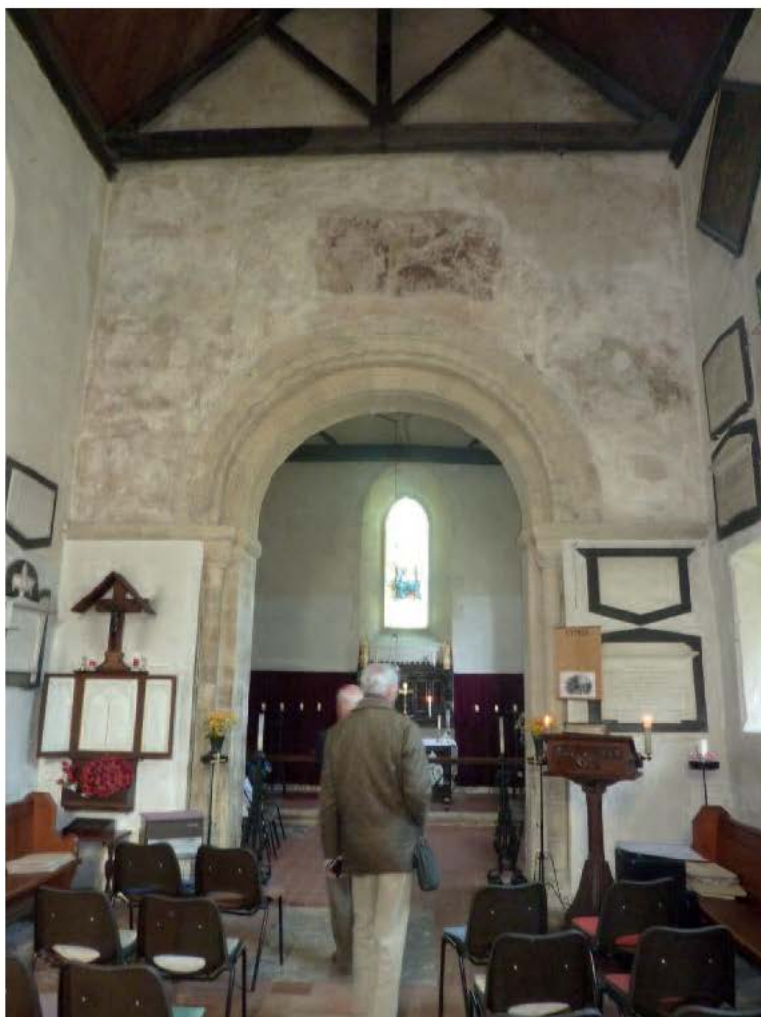
Remains of wall paintings at Walmer Old Church

Back in Sandwich, there are older houses built in stone. We were standing outside the ruins of one of them, in Three Kings Yard at the corner of Strand Street, bringing blank stone walls to life, when, amazingly, we were all invited to squeeze in to what is now the courtyard garden of a later timber-framed property. With her washing flapping around her, the owner showed off the remains of the house and gave us further scope for imagining ourselves at the end of the thirteenth century. The house was for sale, by the way.