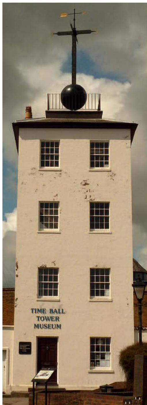
The Time Ball Tower, Deal