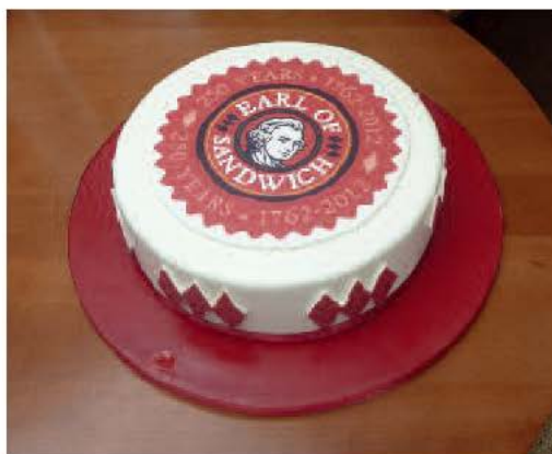
Celebratory cake for the Earl's lunch