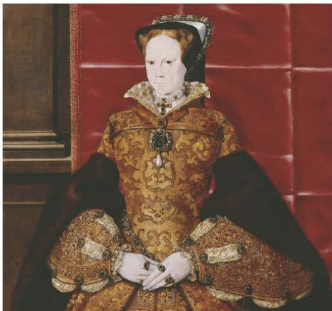
Mary I by Hans Eworth. Oil on oak panel, 1554 She sports jewels very similar to those in the Hoard.