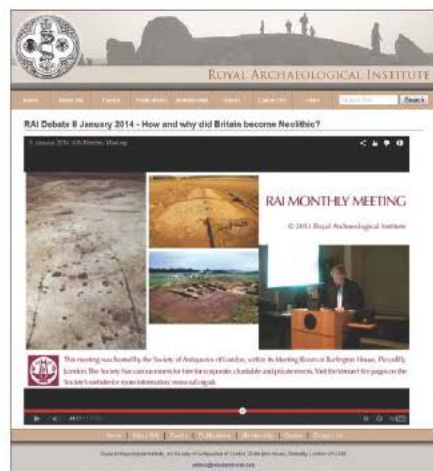
A page from the 2014 on-line debate