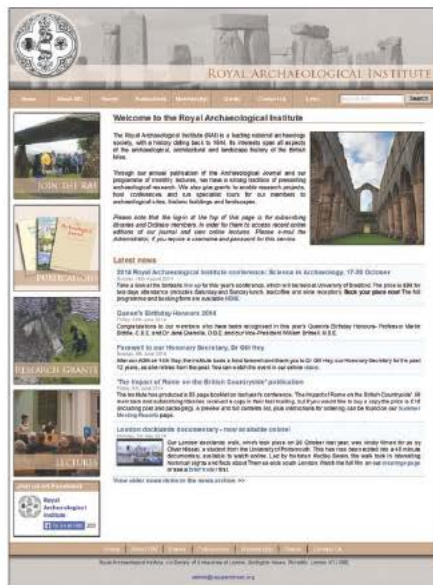
The home page of the RAI's website