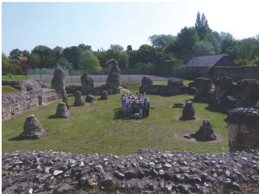
Marking the site of St Edmund's Shrine