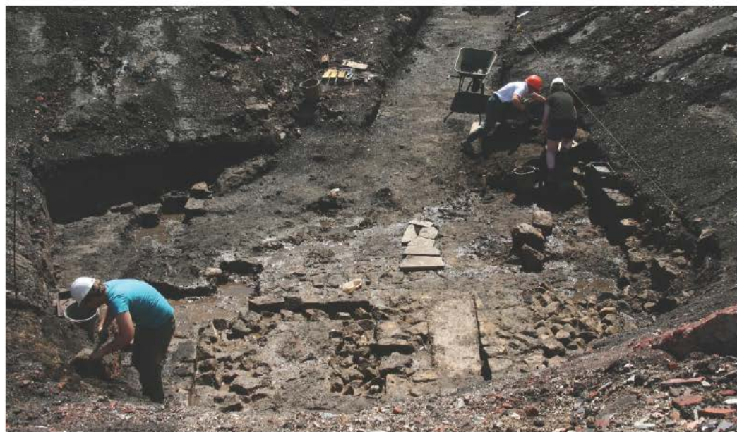
WallQuest at the newly-discovered Roman fort baths at Wallsend

In ‘Illuminating Commercial Archaeology: A Review of New Archaeological Discoveries from