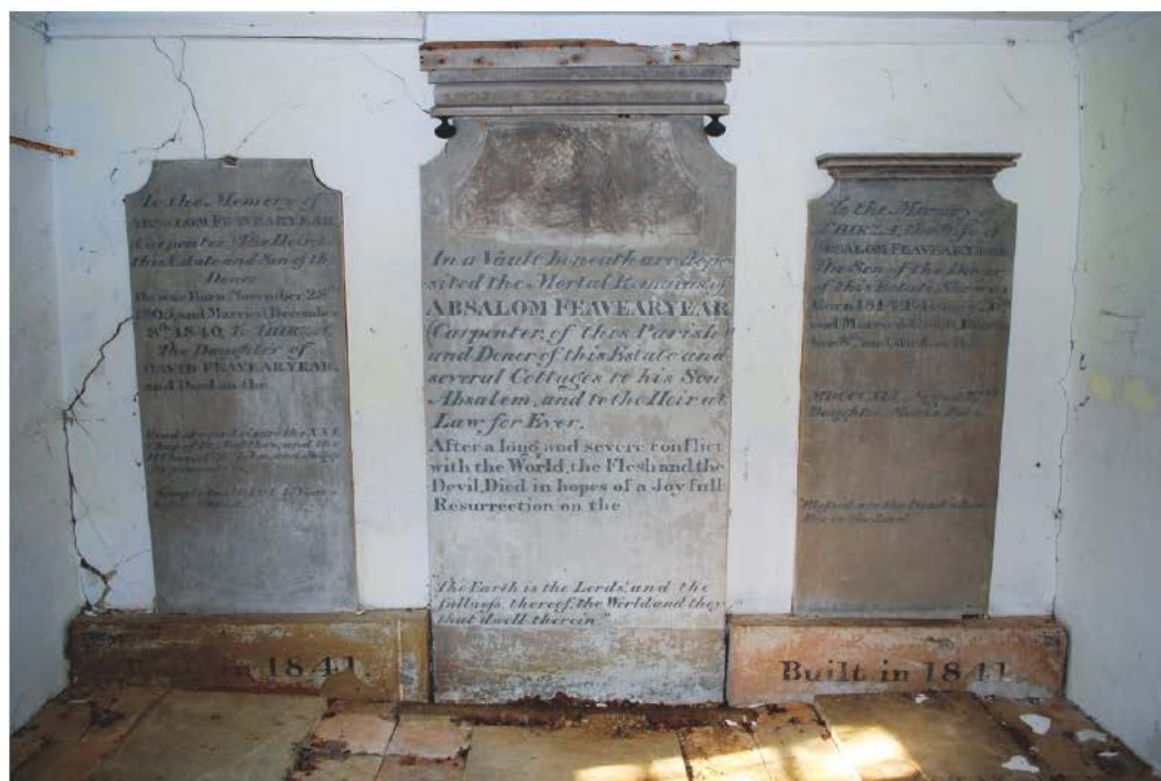
Inside the Feaveryear Mausoleum