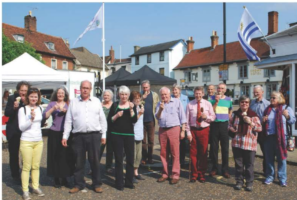
At Framlingham, Market Hill