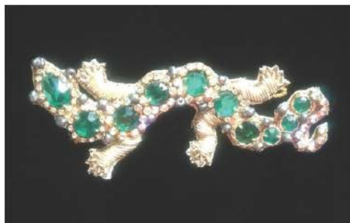
Salamander; gold, diamonds and emeralds: £12.66 (SL)

It was interesting to observe how the exhibition fuelled the desire to eat and shop.