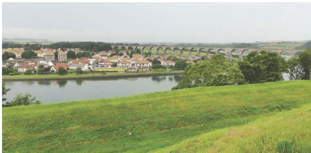
The Royal Border Bridge at Berwick-upon-Tweed (Ann Ballantyne)

The Royal Border Bridge at Berwick-upon-Tweed, seen from the coastline at Spittal, takes me home. It is a railway viaduct built under the supervision of Robert Stephenson in 1847 and the 720-yard span (659 m) with twenty-eight arches swings across the River Tweed into Berwick Station — cutting through the city fortifications. When seen from the train crossing the bridge it is a very elegant structure and pleasing to the eye.