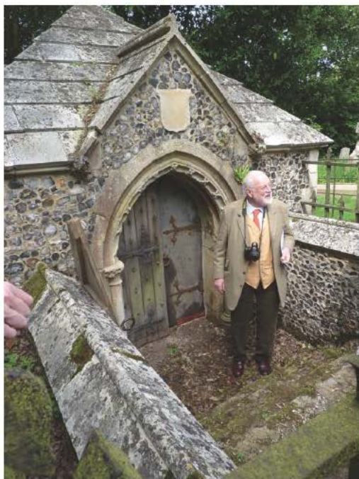
Discussing details of doors at the FitzGerald mausoleum, Boulge (Ann Ballantyne)

Next came St Andrew’s Church, Little Glemham, where the mausoleum of the North family projects from the north side of the building. There appears, according to the monument (by William Holland) to Catherine North (d.1715) in the chancel, to have been a mausoleum (or perhaps only a burial-vault) on the site at least as early as the beginning of the eighteenth century. The structure above ground is a brick box with a Greek Doric interior and segmental vaulted ceiling, given its present appearance in c.1810 when Dudley Long North (1748–1829) caused it to be erected to designs perhaps by John Harvey to function as a family pew above the vault itself. Unfortunately, the entire mausoleum/family pew was under restoration during the visit, so the statue (1833) of North by John Gibson (1790–1866) could not be seen, nor could the 1929 north window by Margaret Edith Rope (1891–1988), and even the exterior was shrouded in scaffolding and coverings. There are several fine funerary monuments in the church.