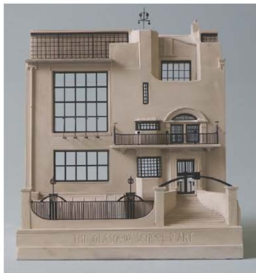
Glasgow School of Art North front. Plaster model by Timothy Richards

The Hunterian Museum is celebrating this research with the first substantial exhibition devoted to Mackintosh's architecture, including specially commissioned films and models together with over 80 architectural drawings, many never previously exhibited, and archival material rarely seen before. The exhibition focuses in particular on