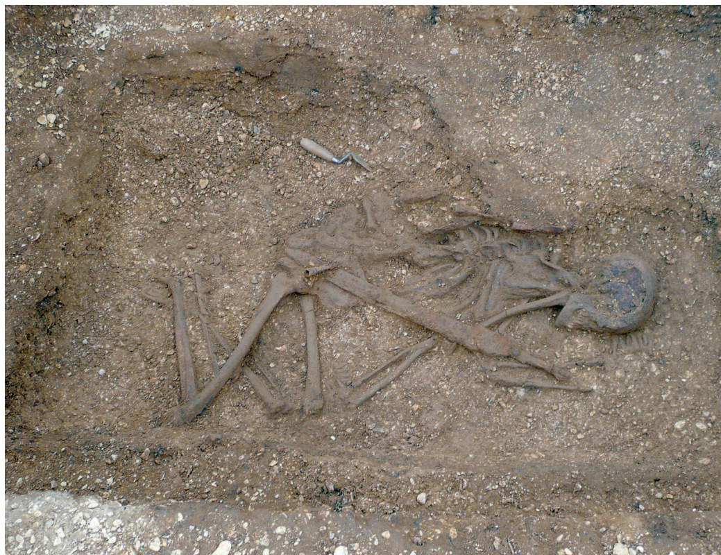
The Pocklington 'Speared Corpse' burial

lectures by leading professionals in the field and early-career archaeologists.