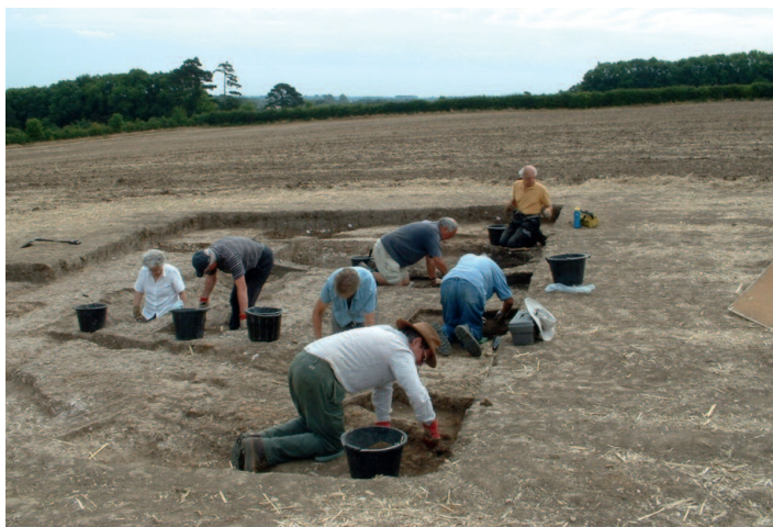
Excavations underway at Hatcliffe Top, Trench D

The Central Lincolnshire Wolds Project is focused upon recovering evidence for past settlement and use of a landscape hitherto little explored archaeologically. It has examined a transect between Caistor and Market Rasen to the eastern fringe of the Wolds as they give way to the flat lands of the Marsh. The multi-period ritual focus and subsequent Roman Roadside settlement on Caistor 'High Street' straddling Nettleton and Rothwell parishes were published in 2013. Volume 2 focuses on the Waithe valley, including Hatcliffe Top. Investigation was a collaborative undertaking by University of Kent and the North East Lincolnshire Archaeology and Local History Society. With