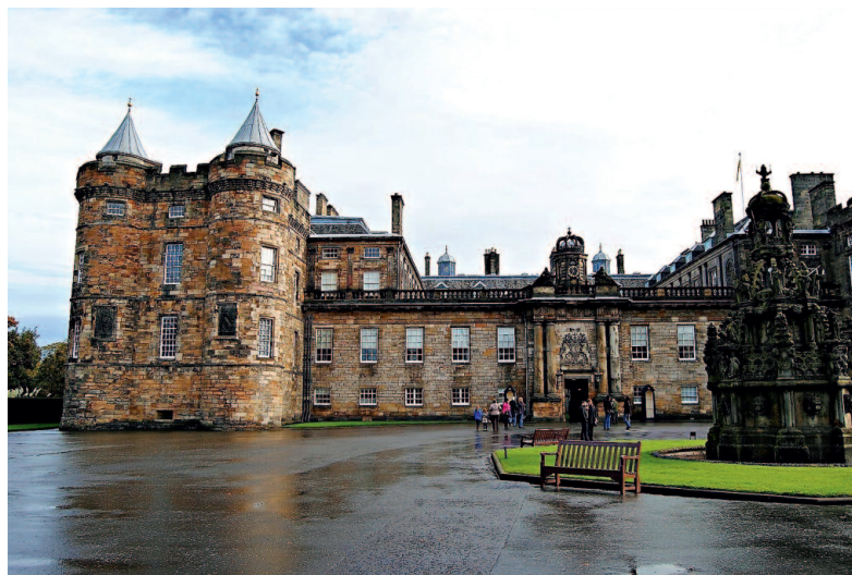
Holyrood House

The Institute has been awarded a Charitable Gift of £2,500 from the Patron's Fund, the charitable fund set up to acknowledge the work of the charitable organisations for which Her Majesty, The Queen acts as Patron, on the occasion of her 90th birthday. The Gift will be used for our project 'A Right Royal Day Out', the aim of which is to give people who would not usually visit historic monuments, the opportunity to experience some of the UK's key sites.