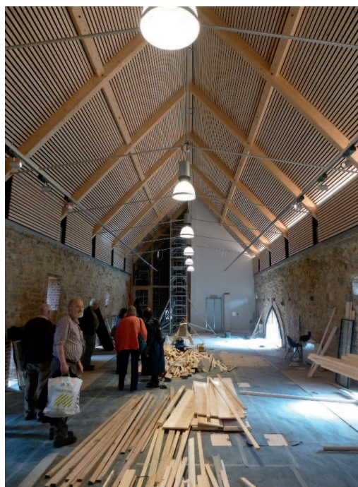
Converting the Great Barn (A. Williams)

Our final discovery lay in Stable Court. Here the barn and rebuilt hayloft (the original barn having repair bills from 1480, and having lost its roof to fire in 1887) are in the later stages of becoming an ultra-modern conservation studio and learning centre. The studio will focus on Knole materials (furniture, paintings, textiles and other specialisms) for two years, and then take on a wider role. It was absorbing to learn how modern conservation work can be accommodated in a finely-preserved ancient building. The ground floor will be a storage area, benefiting from an environmental-control wall-lining over the original wall, to cut down dust. The curiously long, thin lift was adapted in shape to make allowance for a medieval culvert below. In the upper level the reconstructed roof and the wall-top are battened for acoustic purposes. A concrete band on the upper wall became necessary when the huge wall proved to have no foundations: metal rods