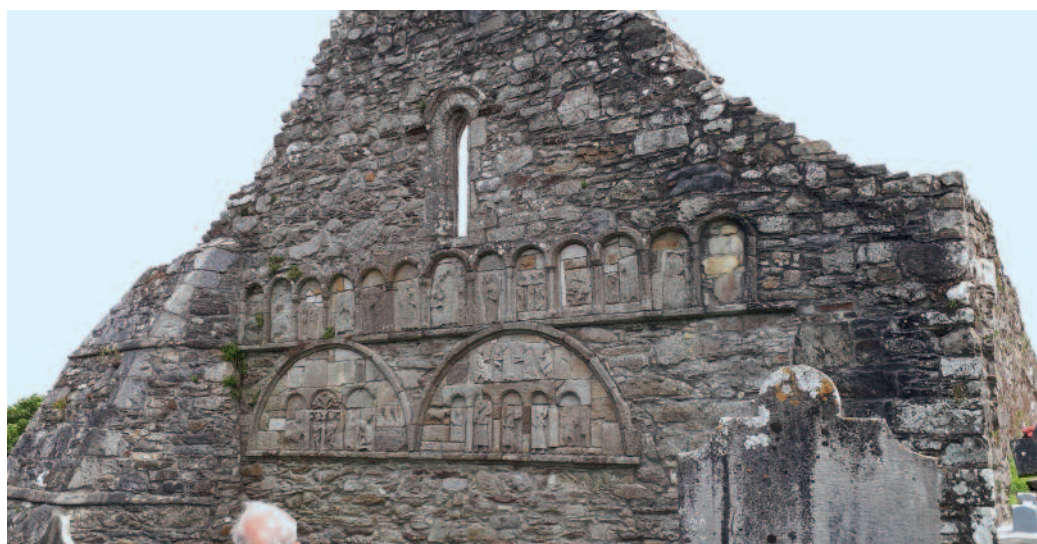
Ardmore, medieval sculpture in the blind arcading (A. Williams)

For lunch, we stopped in Ardmore, a popular seaside village with a mile-long sweep of beach – an opportunity for a paddle. Back in the coach up steep, narrow, winding roads for Ardmore church and Round Tower. Voted one of the favourite