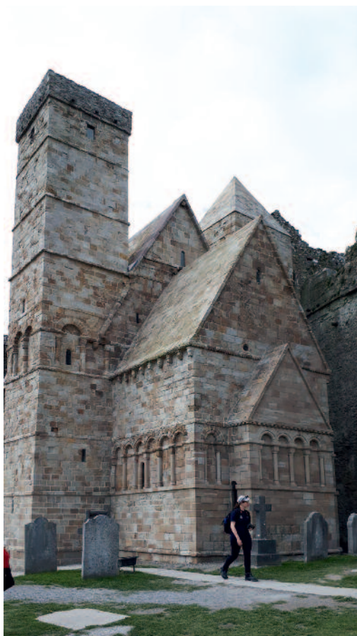
Cormac's Chapel at Cashel (A. Williams)

Outside is a replica of the twelfth-century St Patrick's Cross – the original being on display indoors in the adjacent refurbished Vicar's Choral hall. It is unusual in not having a ring around the