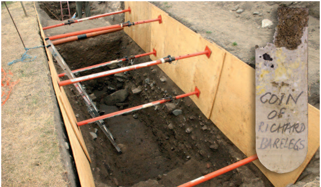
Bamburgh: Trench 8 re-evaluation with shoring

We have amalgamated the artefactual assemblages from the Hope-Taylor and BRP excavations into one contemporary archive. We are evaluating and analysing the metal-work, pottery, and the small lithic and glass assemblages from Trench 8, and now have five radiocarbon dates for key stratigraphic horizons. Together with the worked bone, animal bone and paleoenvironmental assemblages, these will allow the BRP to write up the Hope-Taylor and BRP Trench 8 excavations as one in the Spring of 2018.