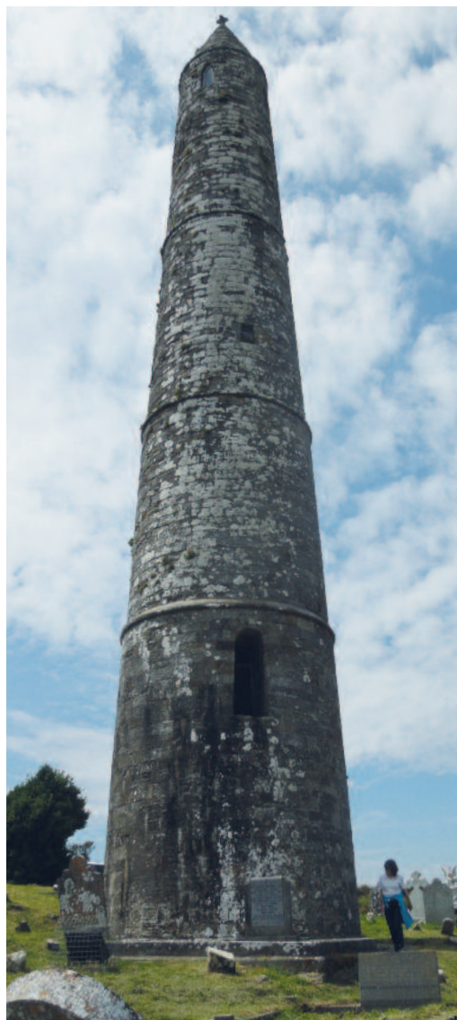
Ardmore, the tower (M. Nieke)

stops of the week, this ruined church (known as the Cathedral), built in the twelfth century, is sited on an, arguably, semi-circular platform, overlooking Ardmore village with views along the coast. The church, despite its sixth-century ogham stones and Romanesque blind arcading on an external wall, is overshadowed by the twelfth-century Round Tower, unusually rising in tiers, to 30m in height. St Declan is said to have founded a monastery here in the sixth century, introducing Christianity to the area. A humble oratory, said to be his burial place, is tucked into the corner of the