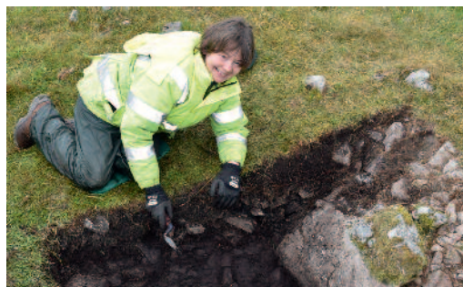
Archaeology Shetland volunteer J. Smith excavating trench across wall of 2nd structure

In addition to the site at Troni Shun, the nearby site of Brunatwatt (HU 2503 5116) was also studied with the aim of characterising the remains and collecting comparative data. The investigations involved the exploration of two adjoining enclosures, one of which had been noted as a possible prehistoric house, and a nearby field system. However, the excavation of two trenches across portions of the enclosures concluded that neither enclosure was a prehistoric house. The recovery of a small number of stone tools indicates possible